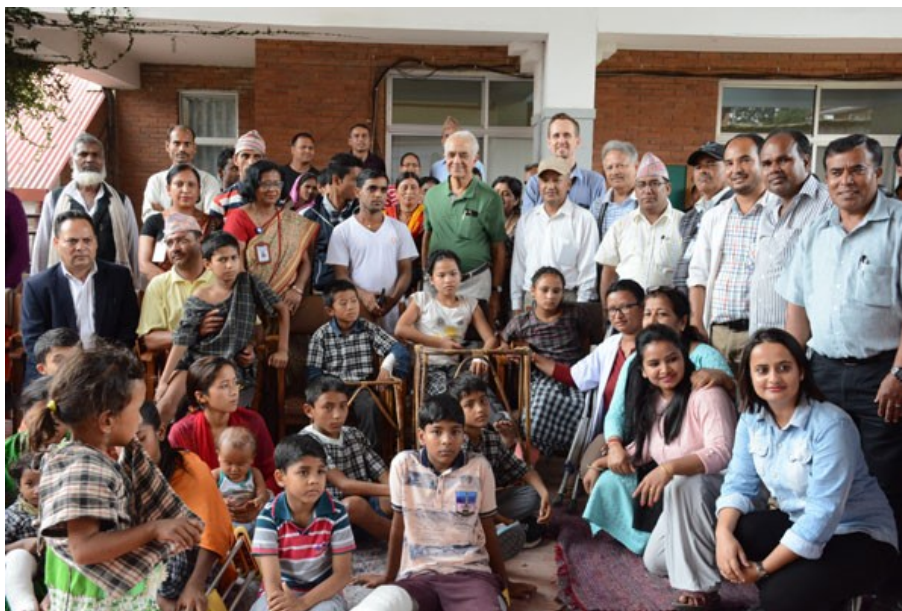
World Clubfoot Day 2017 Celebration at HRDC

Clubfoot is the most common musculoskeletal birth deformity, affecting 150,000-200,000 newborn children each year, 80 percent in developing countries. There are also hundreds of thousands of children and young adults who are living with this debilitating condition worldwide. The Ponseti Method is nearly 100 percent effective when properly applied by a trained health care provider and is considered the "gold standard" treatment leading to a normal, productive life.