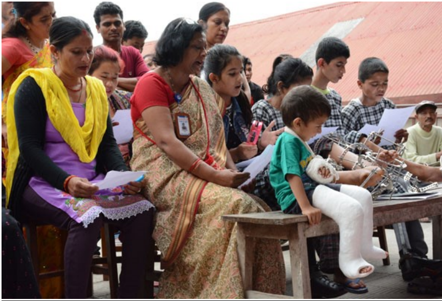
Children and HRDC staff together with parents performing the Ponseti Song