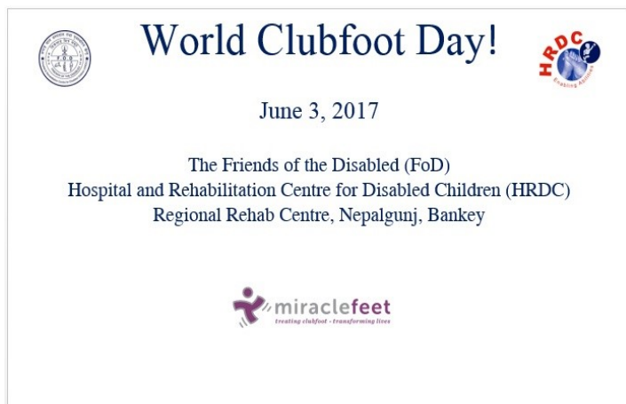
World Clubfoot Day Celebration at Regional Rehab Centre Nepalgunj, Banke