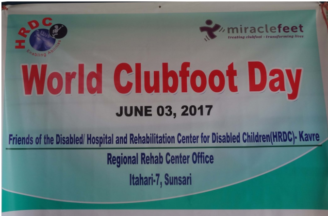
World Clubfoot Day Celebration at Regional Rehab Centre Itahari, Sunsari