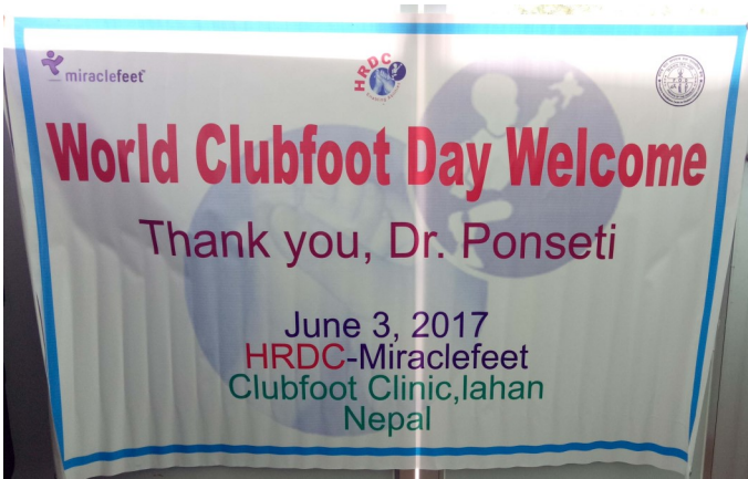
World Clubfoot Day Celebration at Clubfoot Clinic Lahan